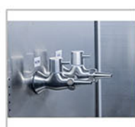
SS Water Tap & Gas Tap