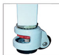
Footmaster Caster Universal caster with brake and leveling feet.