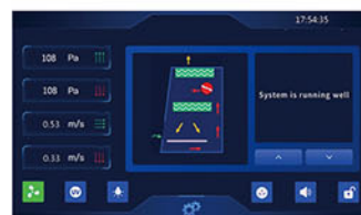
Display for BSC-2FA2-GL

Color Touch Screen Touch operation, real-time and clearer display of various values and appointment timing function.