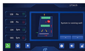
Display for BSC-2FA2-NA