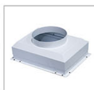
Exhaust Thimble Canopy (Optional)