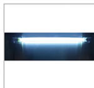
UV Lamp Emission of 253.7 nanometers for most efficient decontamination.